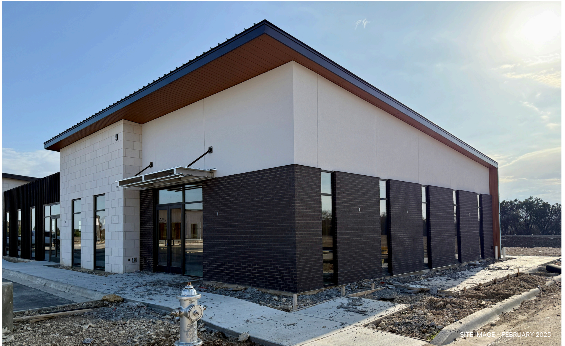
SITE IMAGE - FEBRUARY 2025