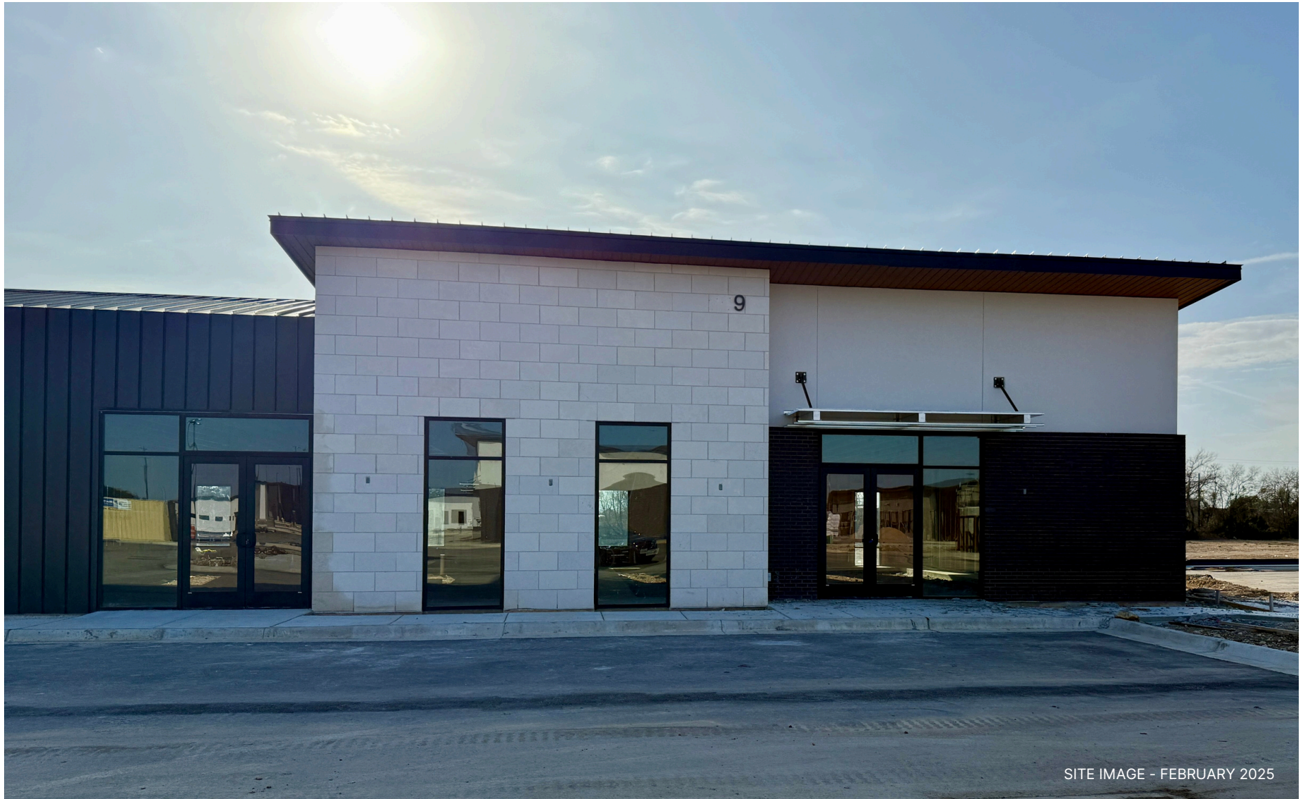
SITE IMAGE - FEBRUARY 2025