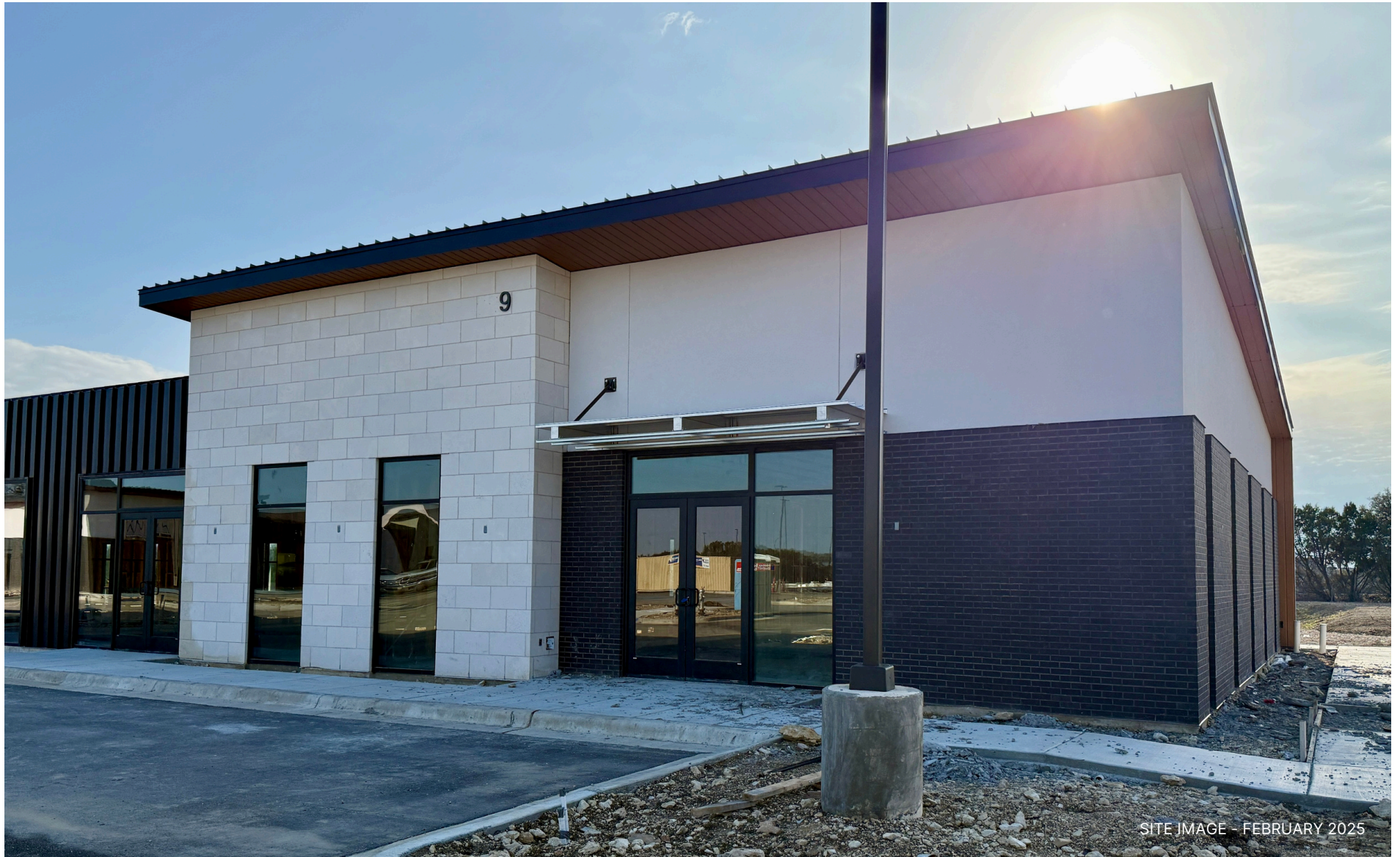
SITE IMAGE - FEBRUARY 2025