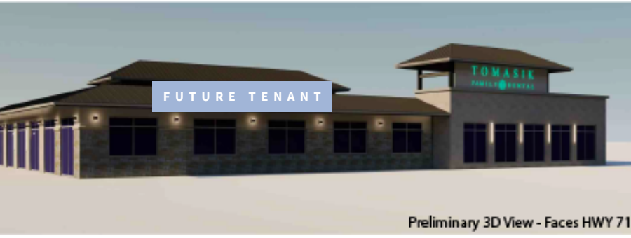
Preliminary 3D View - Faces HWY 71