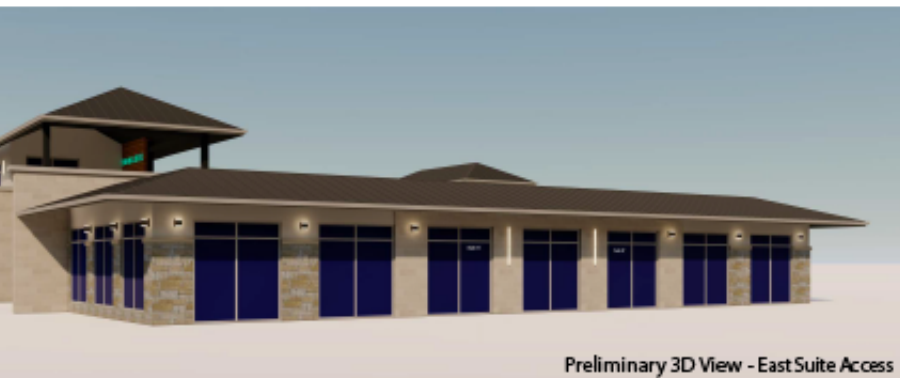
Preliminary 3D View - East Suite Access