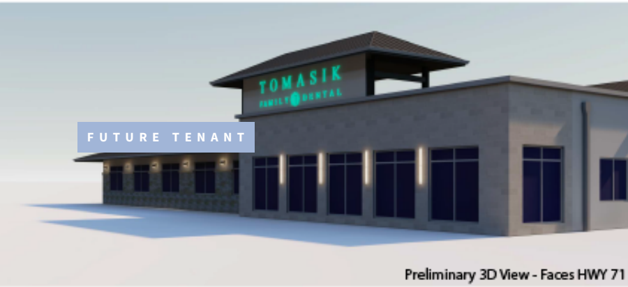
Preliminary 3D View - Faces HWY 71