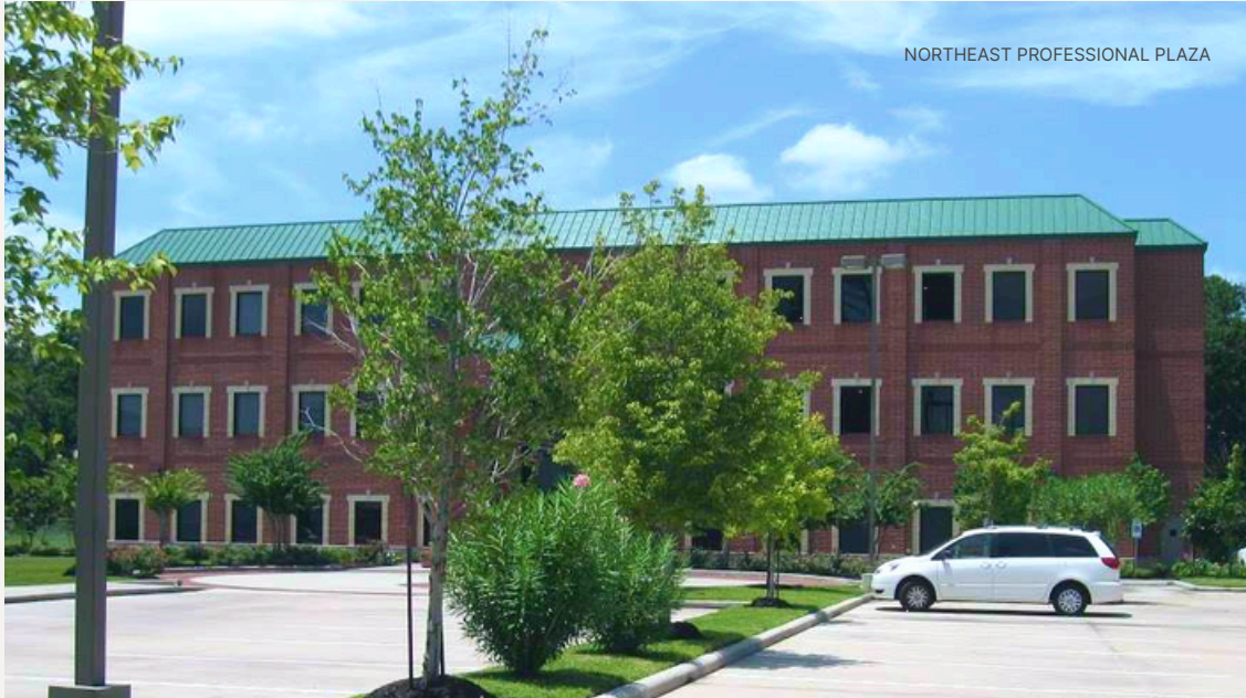
NORTHEAST PROFESSIONAL PLAZA